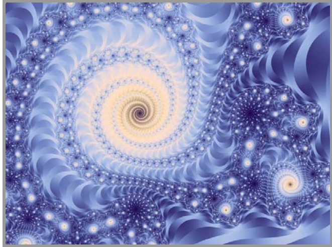
Starstorm

Personal unfolding will never be easy, since there is a lot of momentum to stay asleep and undeveloped, coming from both within us and outside of us. So we need ways of waking ourselves up, a bell to ring in the dormitory of our minds, to summon our infinite inner resources to the tasks of creative love, and the building of a new civilization based on the fourteen qualities described above. As some of you will know from my little book on the evolution of prayer, I am an active explorer of new forms of prayer, meditation and affirmation. I invite you to explore repeating the