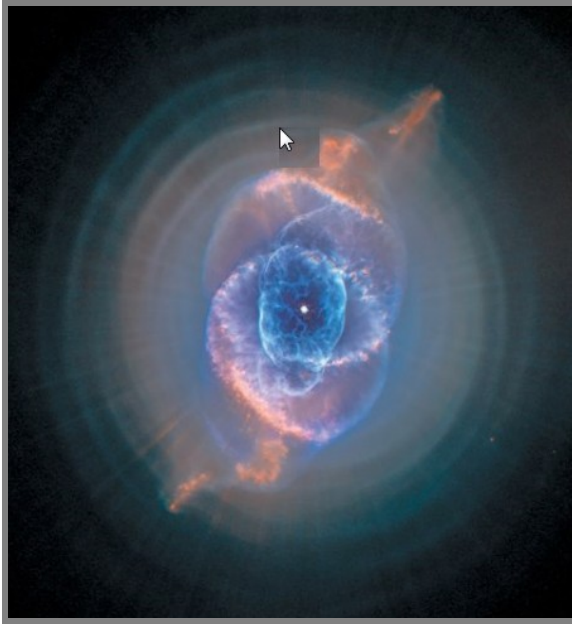
Evolution of White Dwarf Star Hubble Telescope

person's garden of approximately one hundred billion neurons. One author called it "the three-pound universe." Fifty years ago, biologist Jacques Monod could sneer, "what is the brain but a machine made of meat?" Very few people talk like that anymore. Just as the Hubble telescope dramatically changed our view of "empty space," new brain studies are dramatically expanding our vision of the six inches between our ears.